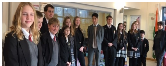
Pictured left to right: a selection of gifts, handing the gifts over and members of the College Council welcoming Caritas staff.